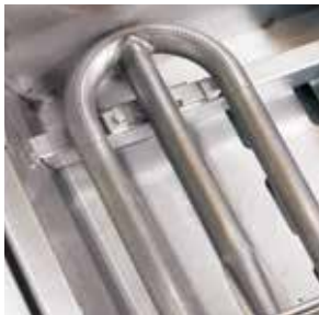
STAINLESS STEEL BURNERS