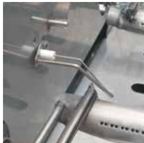
SPARK IGNITION SYSTEM