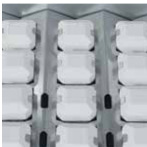
CERAMIC RADIANT BRIQUETTES