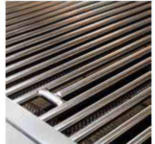
EXPANSIVE GRILLING SURFACE

FOR MORE INFORMATION ON SEDONA BY LYNX™ SERIES PRODUCT FEATURES, PLEASE VISIT LYNXGRILLS.COM