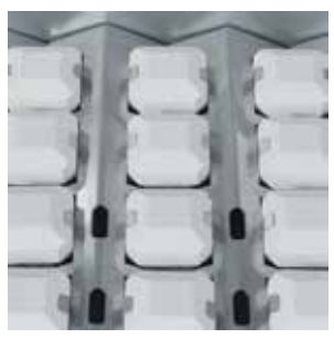
CERAMIC RADIANT BRIQUETTES