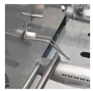
SPARK IGNITION SYSTEM