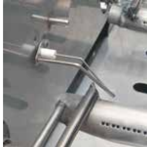
SPARK IGNITION SYSTEM