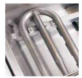
STAINLESS STEEL BURNERS