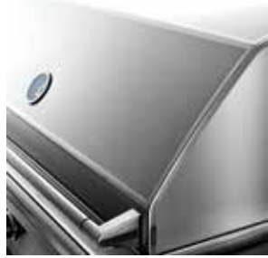
SEAMLESS WELDED CONSTRUCTION