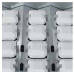
CERAMIC RADIANT BRIQUETTES