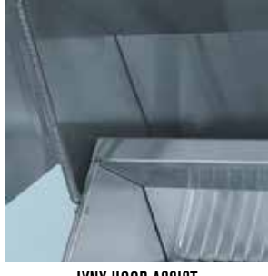
LYNX HOOD ASSIST