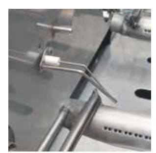
SPARK IGNITION SYSTEM