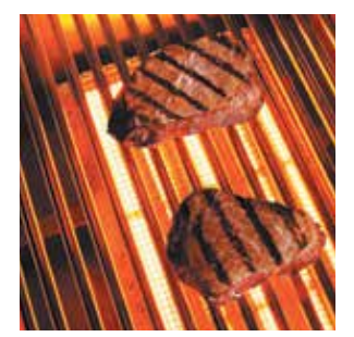
PROSEAR™ INFRARED BURNER

The Sedona by Lynx™ Series is always evolving to be the best at something new. That philosophy is reflected in its features. We've refined these features to give you a grilling experience that's both simple and stunning.