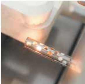
HOT SURFACE IGNITION