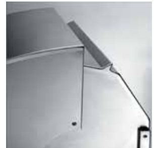
HEAT STABILIZING DESIGN