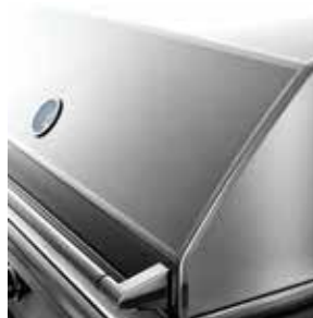
SEAMLESS WELDED CONSTRUCTION