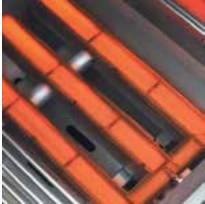
TRIDENT™ INFRARED BURNER

Our unrelenting attention to detail and our passion for innovation have fostered the stunning features that define the Lynx Professional Series. These features begin with meticulous hand-crafted excellence, and they culminate in powerful capabilities that give you precision control.