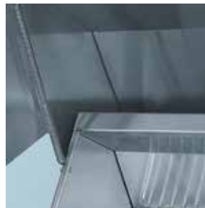
LYNX HOOD ASSIST