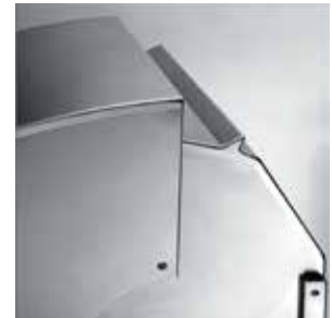
HEAT STABILIZING DESIGN