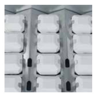
CERAMIC RADIANT BRIQUETTES