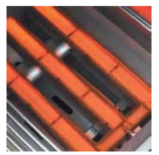
TRIDENT™ INFRARED BURNER

Our unrelenting attention to detail and our passion for innovation have fostered the stunning features that define the Lynx Professional Series. These features begin with meticulous hand-crafted excellence, and they culminate in powerful capabilities that give you precision control.