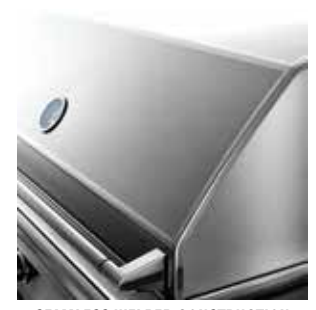
SEAMLESS WELDED CONSTRUCTION