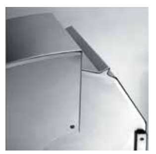
HEAT STABILIZING DESIGN