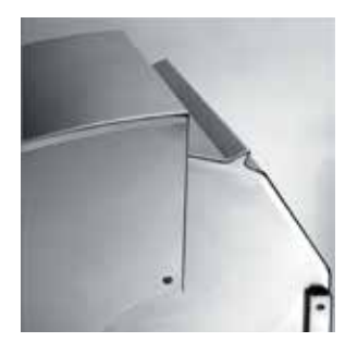
HEAT STABILIZING DESIGN