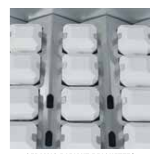
CERAMIC RADIANT BRIQUETTES