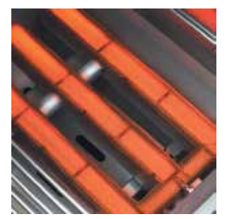
TRIDENT™ INFRARED BURNER

Our unrelenting attention to detail and our passion for innovation have fostered the stunning features that define the Lynx Professional Series. These features begin with meticulous hand-crafted excellence, and they culminate in powerful capabilities that give you precision control.