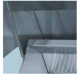
LYNX HOOD ASSIST

FOR MORE INFORMATION ON LYNX PROFESSIONAL PRODUCT FEATURES, PLEASE VISIT LYNXGRILLS.COM