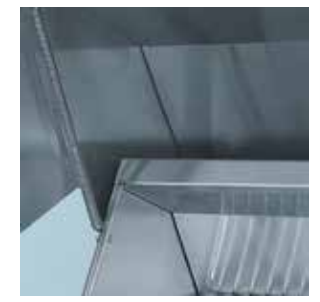
LYNX HOOD ASSIST