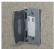
Each island includes a USB charging port