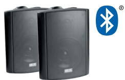
Each island includes a pair of Bluetooth® speakers

The Ready to Finish island or full packages can help create your outdoor kitchen for a third of the cost.