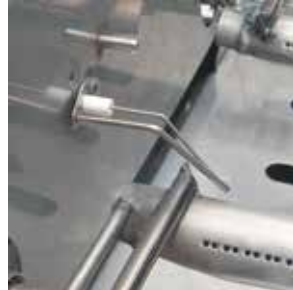
SPARK IGNITION SYSTEM