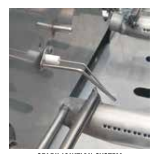
SPARK IGNITION SYSTEM