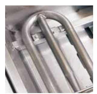
STAINLESS STEEL BURNERS

The Sedona by Lynx™ Series is always evolving to be the best at something new. That philosophy is reflected in its features. We've refined these features to give you a grilling experience that's both simple and stunning.