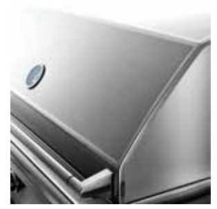
SEAMLESS WELDED CONSTRUCTION