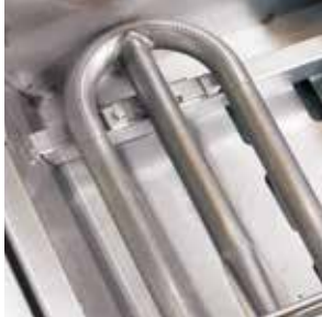
STAINLESS STEEL BURNERS

The Sedona by Lynx™ Series is always evolving to be the best at something new. That philosophy is reflected in its features. We've refined these features to give you a grilling experience that's both simple and stunning.