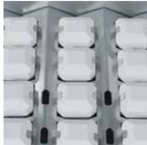
CERAMIC RADIANT BRIQUETTES