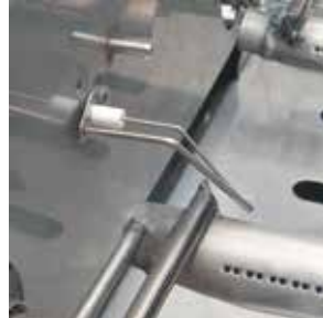
SPARK IGNITION SYSTEM