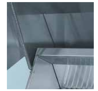
LYNX HOOD ASSIST