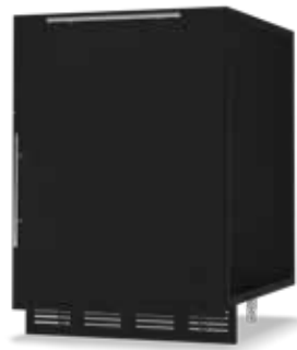
DRAWER AND DOOR BASE 12" WIDTH AVAILABLE