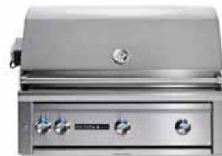
SEDONA BY LYNX™ GRILLS