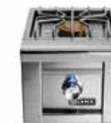
SINGLE SIDE BURNER