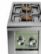
DOUBLE SIDE BURNER Shown in Desert Sage