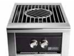
POWER BURNER Shown in Obsidian