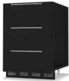
3 DRAWER BASE

Smart storage meets rugged design in these functional cabinets, crafted to keep tools, accessories, and ingredients close at hand. Their form and finish complete the outdoor kitchen experience.