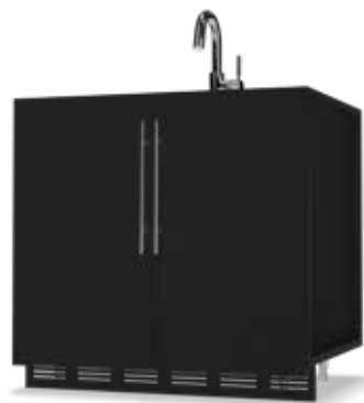
DROP-IN SINK BASE

Crafted for versatility, Lynx outdoor sink bases pair effortlessly with Lynx sinks or other drop-in options to suit your outdoor kitchen vision.