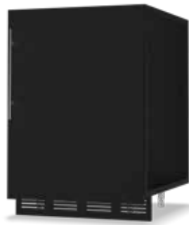
FULL DOOR BASE LEFT AND RIGHT HINGE