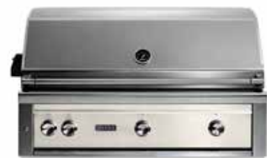
PROFESSIONAL GRILLS Shown in Glacier