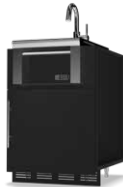
LYNX SINK BASE LEFT AND RIGHT HINGE