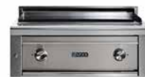
ASADO Shown in Limestone