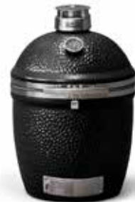
KAMADO GRILL Shown in Gloss Black