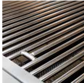
EXPANSIVE GRILLING SURFACE