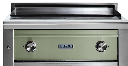
30" PROFESSIONAL BUILT-IN ASADO COOKTOP DISPLAYED IN DESERT SAGE