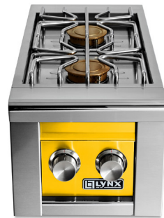
PROFESSIONAL BUILT-IN DOUBLE SIDE-BURNERS DISPLAYED IN CALIFORNIA POPPY