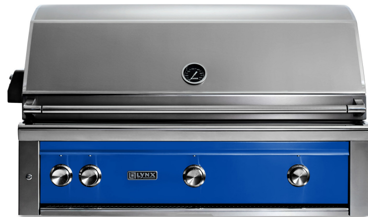
30" / 36" / 42" / 54" PROFESSIONAL BUILT-IN GRILLS DISPLAYED IN PACIFIC BLUE

The Lynx Professional Outdoor Color Collection is available on control panels of a variety of Lynx Grills products while the hood, trim, knobs, and handles remain high-grade stainless steel. These painted panels are powder coated to beautifully withstand the elements.