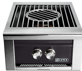
PROFESSIONAL BUILT-IN POWER BURNER DISPLAYED IN OBSIDIAN