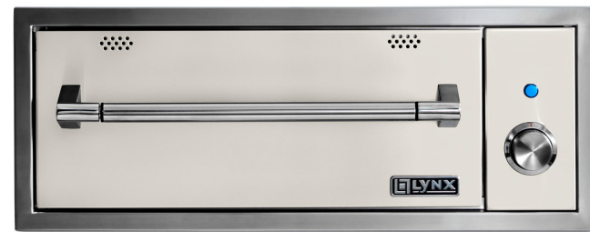
30" PROFESSIONAL BUILT-IN WARMING DRAWER DISPLAYED IN GLACIER